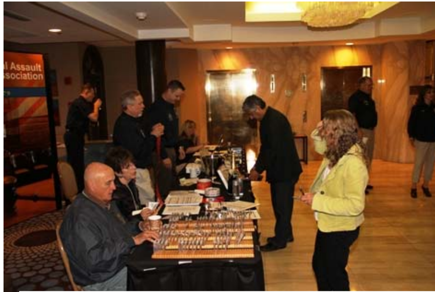
Members registered at the 2014 spring Conference in Shell Beach, CA.