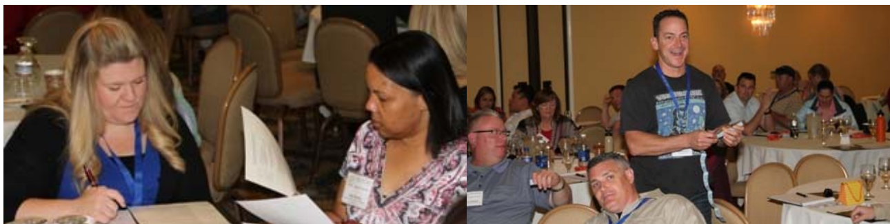
CSAIA Members enjoying the conference.